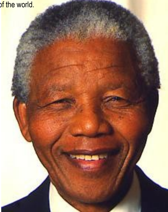
Nelson Rolihlahla Mandela

Mandela spent 67 years making the world a better place, beginning in 1942 when he first started to campaign for the human rights of every South African. The UN has also asked the people of the world to set aside 67 minutes of their day to undertake a task that would contribute to bringing joy or relief to the millions of disadvantaged and vulnerable people of the world.