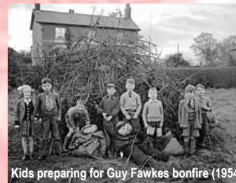
Kids preparing for Guy Fawkes bonfire (1954)

In 1606, an Act of Parliament established November 5th as a day of public thanksgiving by lighting bonfires for "the joyful day of deliverance", to celebrate the King's escape from assassination. Guy Fawkes Night (also referred to as Guy Fawkes Day and Bonfire/Cracker Night) is now celebrated annually across Great Britain (and many of it's colonies) on November 5th in remembrance of the Gunpowder Plot. As dusk falls, villagers and city dwellers light bonfires, set off fireworks and burn effigies of Fawkes, a "guy" normally created by children from old clothes, newspapers, and a mask. https://www.history.com/topics/british-history/gunpowder-plot